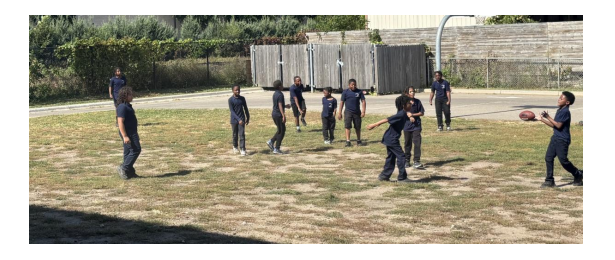
4th and 5th Grade Scholars playing football

source:https://www.biography.com/political